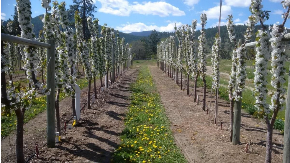
A research orchard in the Okanagan Valley, British Columbia.

Thank you for your continuous support of the CSHS. Please encourage your students, colleagues and friends to join. We are looking forward to seeing you all face-to-face in the near future at the CSHS & CSA Joint Conference on June 23-26, 2025, in Kelowna, BC.